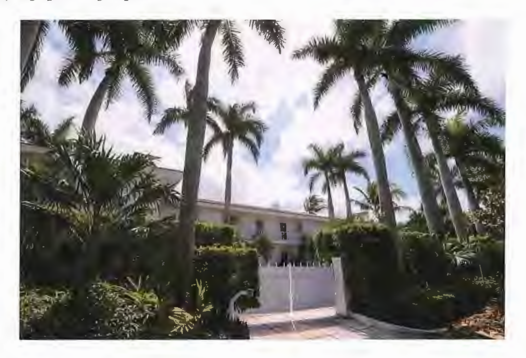
c. A ranch in Santa Fe, New Mexico owned by Epstein (the "New Mexico Residence"), which is depicted in the following photograph:

b. An estate in Palm Beach, Florida owned by Epstein (the "Palm Beach Residence"), which is depicted in the following photograph: