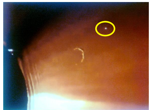
JUNE 30 2012 THESE ARE "HORNS OF THE BULL" DID NOT MOVE AWAY BUT REMAINED IN PLACE

The "orb" in the picture on the right was some sort of planetoid or craft the size of the Earth