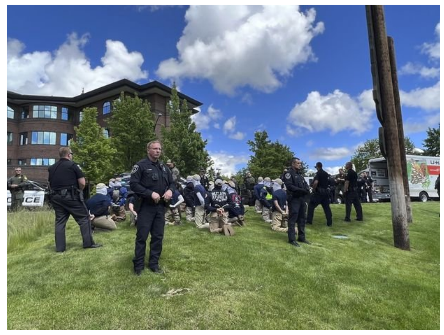
Idaho police said they are getting death threats after arrests of members of a white supremacist group over the weekend.

Coeur d'Alene investigators still gathering evidence after arresting people believed to be members of a white supremacist group near a local pride event