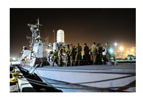
The INS Nitzachon at Haifa naval base

A few minutes after 9:00 pm, <u>Sa'ar 5-class</u> corvettes <u>INS Lahav</u> and <u>INS Hanit</u>, and the <u>Sa'ar 4-class missile boat</u> INS Nitzachon