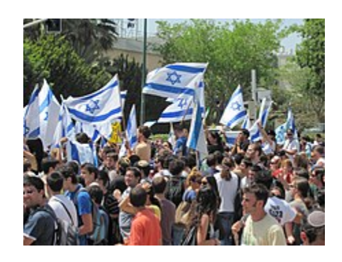
Tel Aviv university students support Israel against Gaza Flotilla.

In Israel, the <u>Israel Police</u> and <u>Israel Prison</u> <u>Service</u> were placed on high alert throughout the country, residents of communities close to the border with the Gaza Strip were ordered to prepare their bomb shelters, and a number of checkpoints were set up along the Israel–