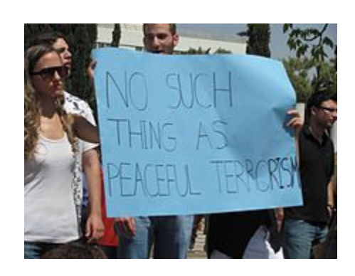
Tel Aviv university students support IDF and Israel against Gaza Flotilla.

Gaza Strip border. The IDF placed units along the northern and southern borders on alert, and called up reservists. Roads towards the <u>Temple Mount</u> in <u>Jerusalem</u> and other controversial areas were blocked by police. [236]