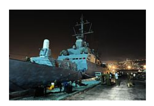
The INS Hanit at Haifa naval base