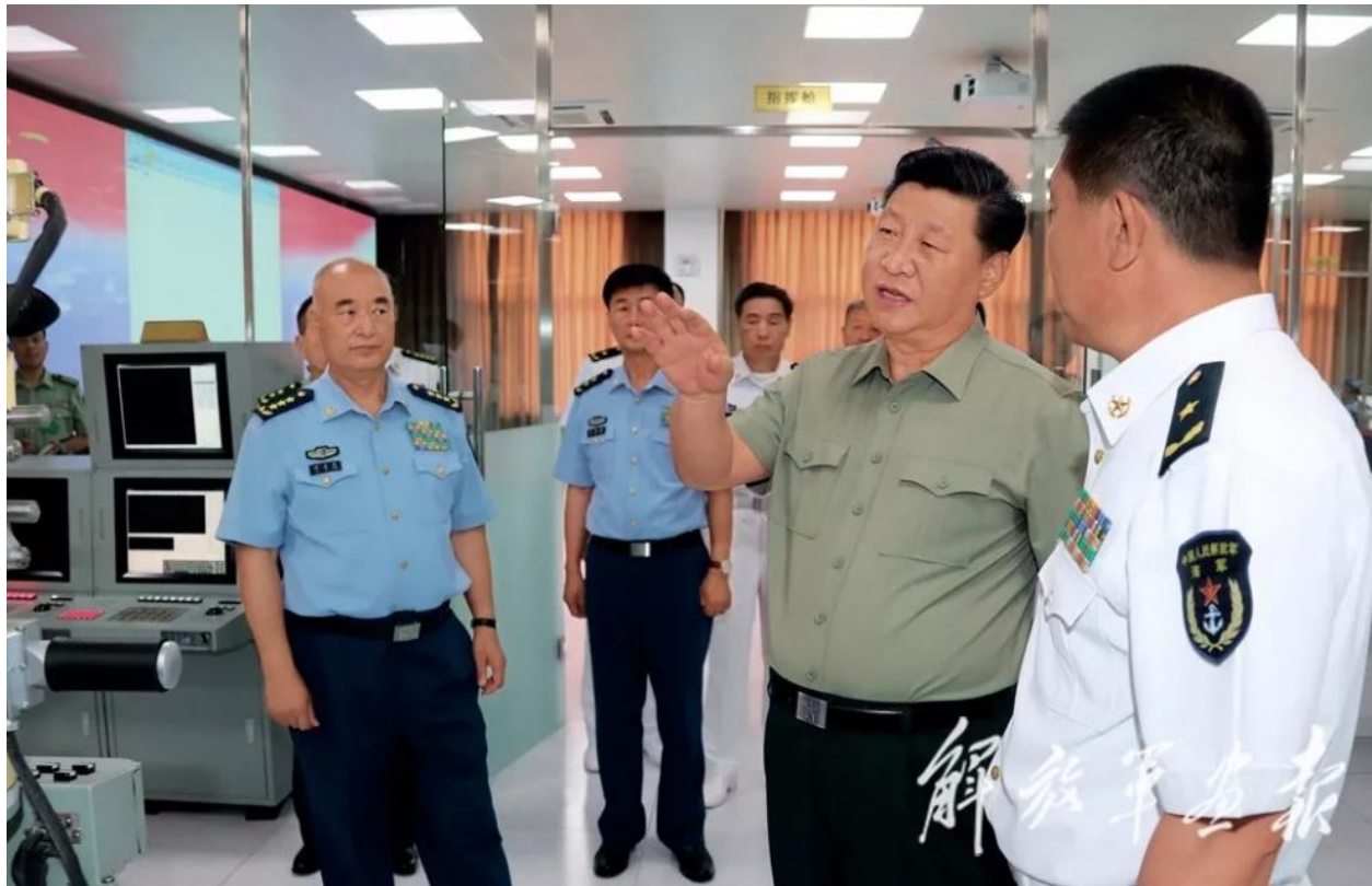
Exhibit 1. Xi Jinping visits a Northern Theater Command Navy submarine training facility (11 June 2018). 4

June 2018 speech reflects a renewed CMC emphasis on PLA training in order to advance capabilities necessary to address additional operational requirements driven by changes in strategic guidance. This report argues that the PLA began a concerted effort to adopt new tactical and operational concepts to address these requirements starting in 2018 and that these efforts have significant implications for submarine doctrine and how the submarine force trains.