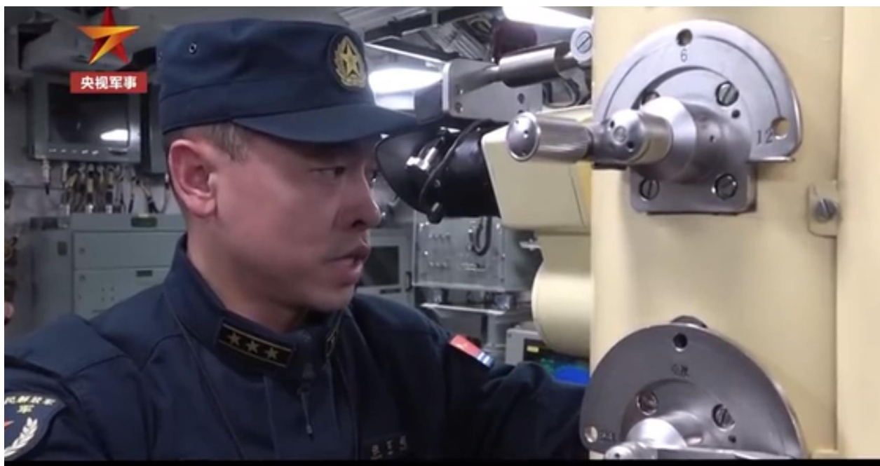
Exhibit 4. The captain of a Northern Theater Command Navy submarine prepares his boat for a simulated torpedo attack. 59

Another way the submarine force incorporates the concept of coupling at sea is by making exercises less scripted. Submarines encounter unplanned scenarios in exercises, which helps to improve a crew’s combat proficiency by preparing it to address unexpected real-world contingencies in the western Pacific. Recent submarine training has included training on breaking through surface ship blockades, reconnaissance, anti-surface warfare, and confrontations at sea—all without command guidance or stipulated tactical responses. 57 The absence of command guidance during these evolutions suggests submarine crews are afforded greater autonomy to respond to situations as they arise rather than having to adhere to a prescriptive tactical response. Moreover, PLA press lauds submarine crews whose innovative responses to unscripted scenarios help to identify tactical responses other units can adopt to improve their own combat capabilities. 58