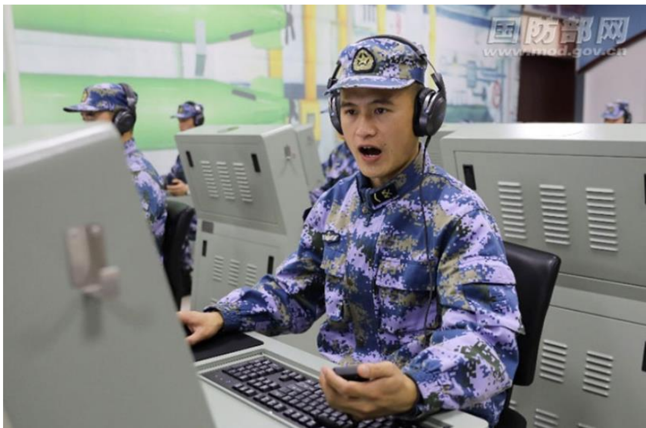
Exhibit 6. A PLAN sonar technician trains in a shore facility. 69

Another implication of PLAN incorporating this training guidance is that the PLA is likely to increase the integration of artificial intelligence (AI) into submarine training. AI is already used to improve the capabilities of PLAN sonar operators. 68 Increasing its use could support command decision-making by recommending tactical maneuvers to optimize a submarine’s approach to a target, thereby enhancing weapons employment for attack while improving timing effectiveness for evasion geometries post attack. Moreover, it could help to improve basic submarine skills such as awareness of underwater hazards and bolster crews’ ability to effectively respond for damage control. Further integrating AI into training will likely help to improve the quality of submarine training both ashore and at sea and will expose crews to real-world situations they may encounter during combat patrols.