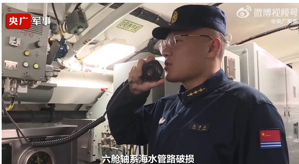
Exhibit 5. A boat belonging to a Northern Theater Command Navy submarine flotilla commences a damage control drill. 65

Another basic submarine operational requirement is to be capable of launching a torpedo or fire an anti-ship cruise missile (ASCM). Launching a torpedo requires a submarine to detect a target and maneuver to develop a fire control solution. Maneuvering requires advanced submarine navigation under potentially stressful wartime conditions. Similarly, launching an ASCM requires targeting information that is typically beyond the range of the submarine's organic sensors. This requires the submarine to navigate at shallow depths to receive targeting information from an external source. During this evolution, a submarine must be prepared to react to sudden unexpected situations. Submarine training, therefore, must exercise these capabilities. PLA press suggests this is occurring with submarines incorporating the latest combat tactics for weapons engagement. 64 Each of these capabilities represents critical combat requirements in support of strategic requirements, but they add to long a list of necessary training requirements the submarine force must address.