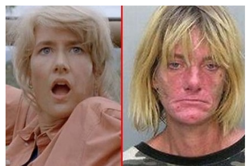
Tragic: She Has Slowly Turned to A Horrible Looking Creature