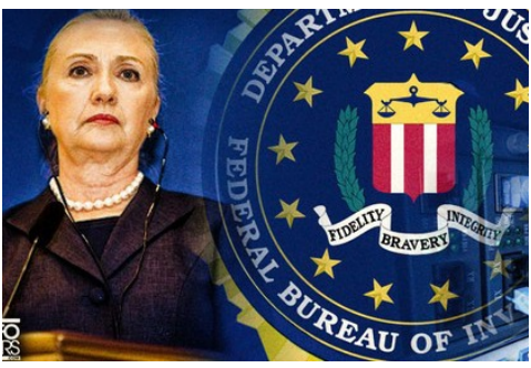
BREAKING: Feds Leak Details of New Clinton Investigation / Weinergate