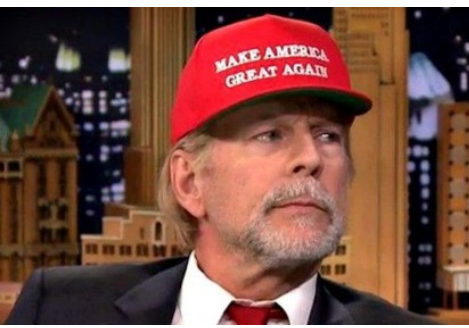
Celebrities That Support Donald Trump