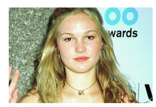
21 Celebrities Who Died And Not a Word Was Said