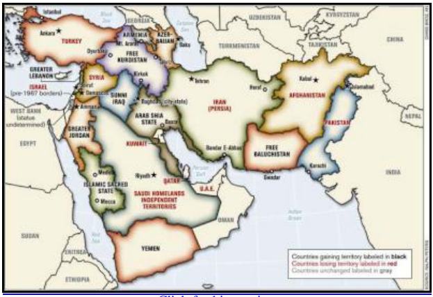
Click for big version

Within the proposed new Middle East, Iran was also reduced, not only by Free Kurdistan, but by "Free Balochistan" which had also borrowed heavily from territory currently claimed by Afghanistan and Pakistan. Balochistan, which lies in the southwest corner of Pakistan, is the largest but least populated of the Pakistani regions. Lately the Chinese have invested heavily in the area by expanding the port city of Gwader. Natural gas, coal, copper and gold offer vast wealth and pipelines will be stretched from Iran to India through the province. Balochistan is also rich in opportunities for drug smugglers with its massive border alongside Afghanistan's most frequented heroin routes. Some political pundits have labeled heroin as the new American Gold Standard - the only thing propping up the bankrupt American economy and the real reason we occupy Afghanistan. Yes, endless war is very expensive for taxpayers but the fat cat international banking and corporate interests in armaments and energy grow wealthier by the minute.