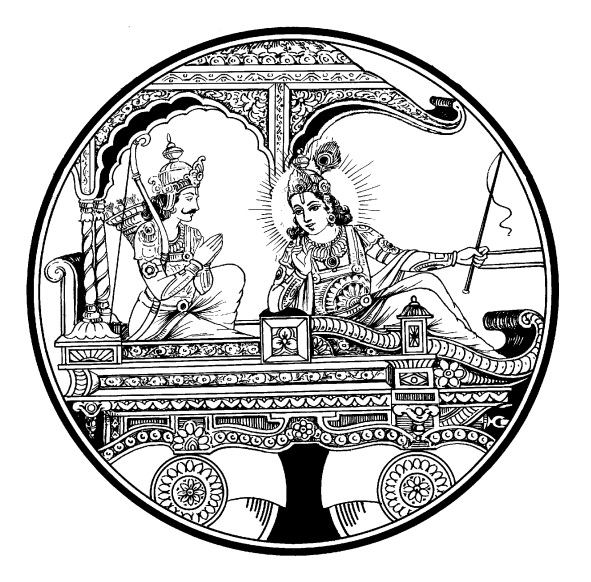
कृष्णात्परं किमपि तत्त्वमहं न जाने