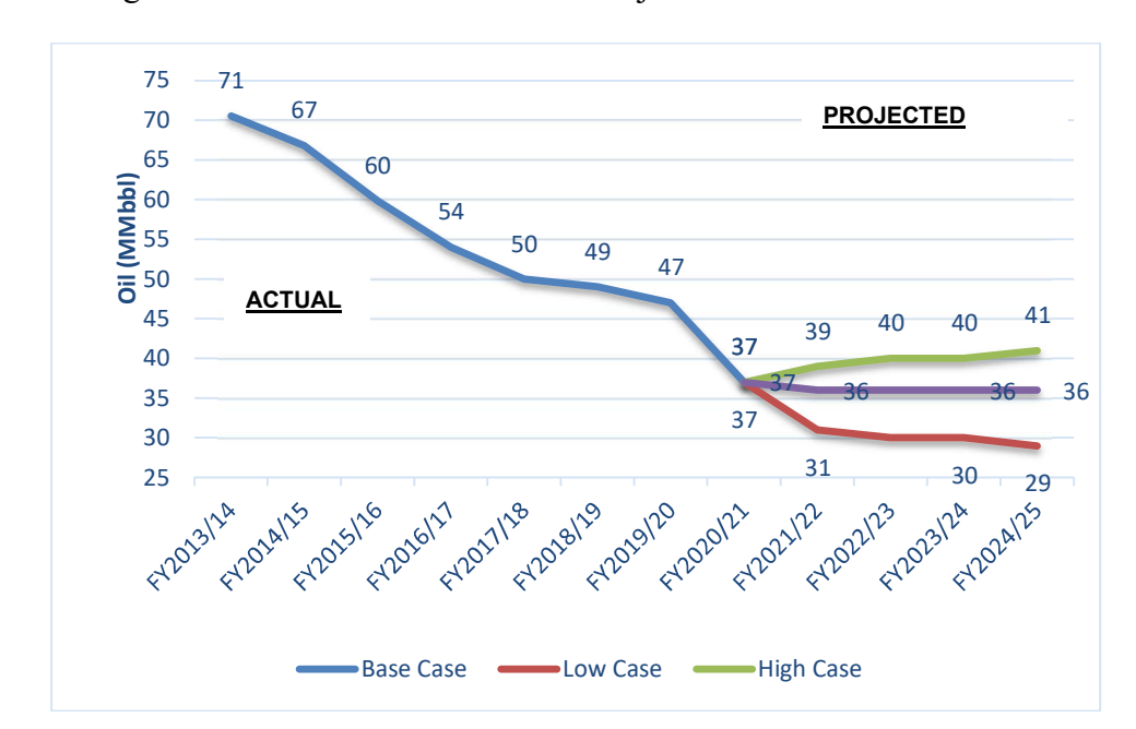
Figure 1: Louisiana Historical and Projected Crude Oil Productions