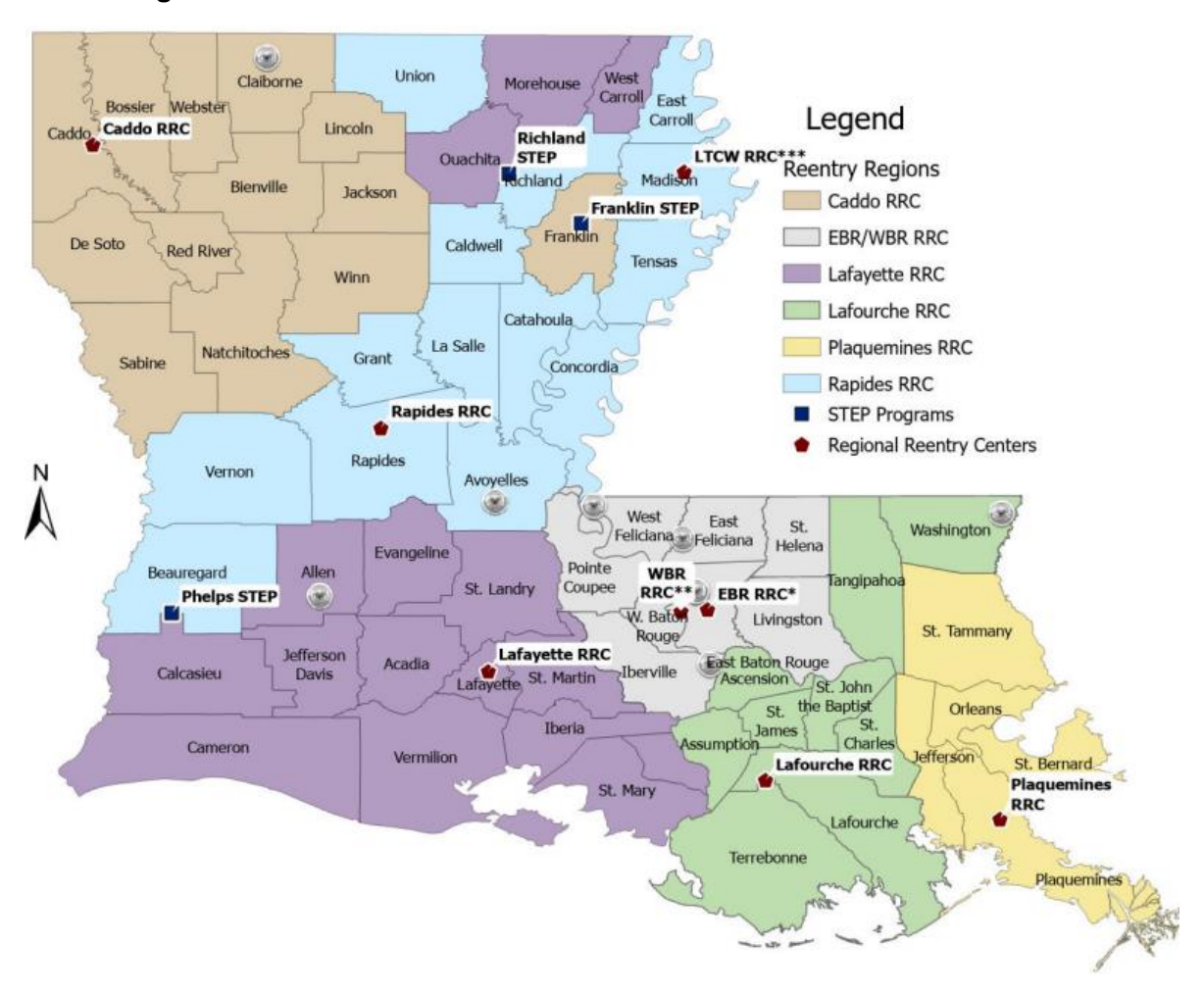
Figure 1: Louisiana Regional Map with State Correctional Facilities, Reentry Centers, and STEP Programs

Through the framework of the reentry centers, DPS&C has utilized the Transition from Prison to Community Model to outline a comprehensive reentry philosophy. The phases of the reentry process under this philosophy are shown below in Figure 2 .