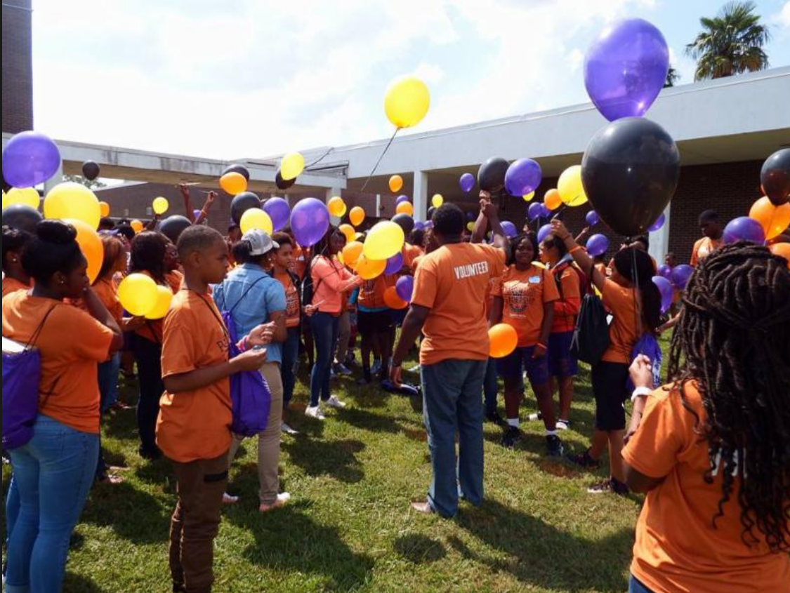
Pictured: Monroe youth releasing balloons into the air at the 2017 Northeast Delta HSA Prevention and Leadership Summit.

Northeast Delta Human Services Authority hosted our Opportunity Zone Youth Summit this September at Wossman High School.