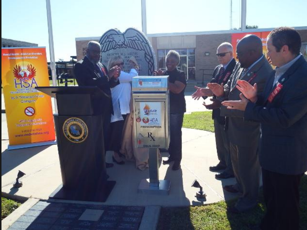
A donated Take Back Box is pictured in front of the Monroe Police Department after its unveiling.