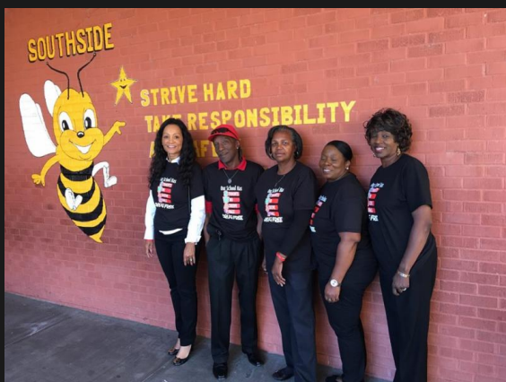
LACAP of Ouachita Parish celebrating Red Ribbon

Students at Delhi Middle School ready for some Red Ribbon Week® activities.