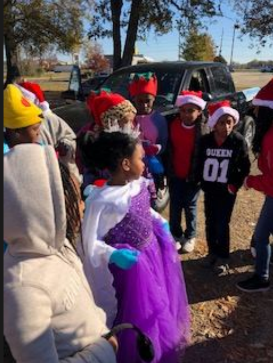
Kids are all smiles in their Christmas costumes as they celebrate the upcoming holiday season at the Second Annual Southside Christmas Parade in South Monroe.

Our staff had an amazing time celebrating the Second Annual Southside Christmas Parade in South Monroe this holiday season. It was a beautiful day to spend with the members of our Opportunity Zone community in support of their efforts to improve the quality of life in Southside Monroe.