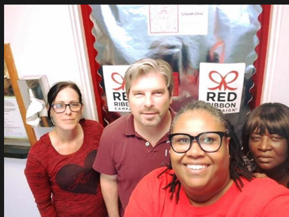
Tallulah staff posing in front of their red ribbon