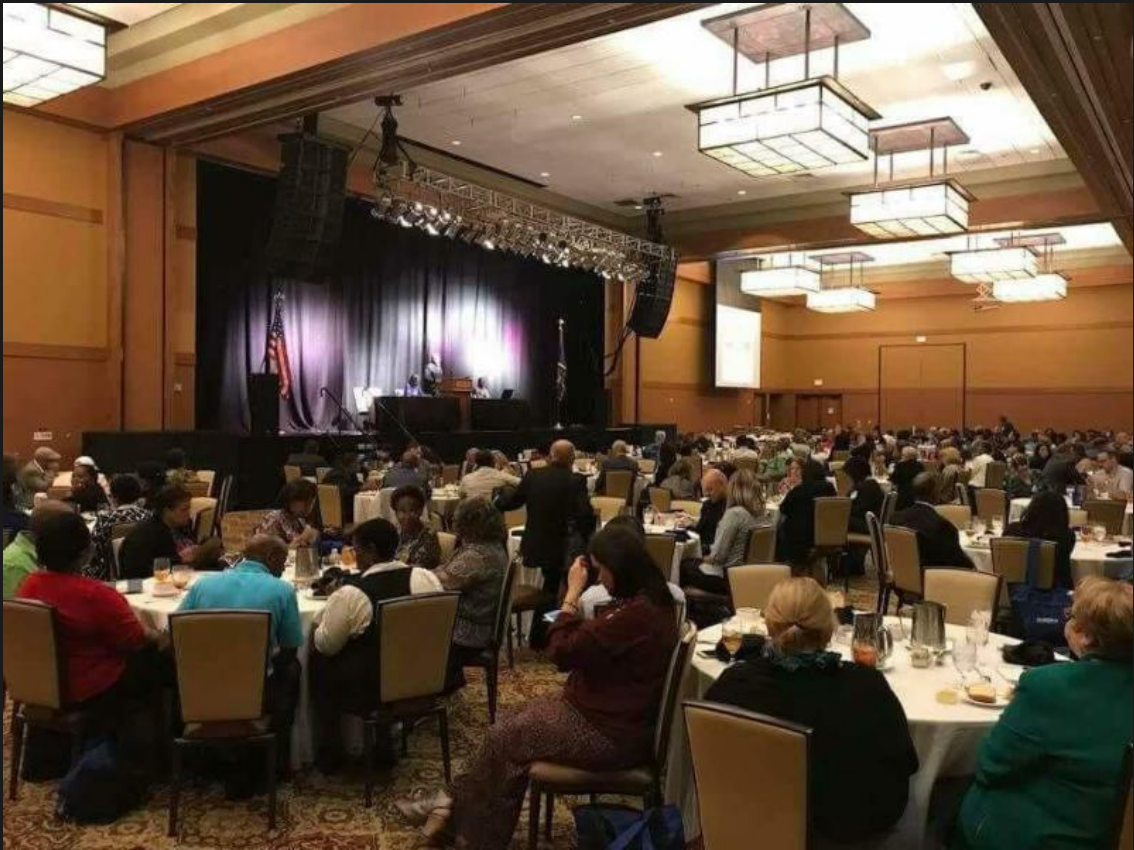
Pictured: 34th Annual Continuing Education Conference