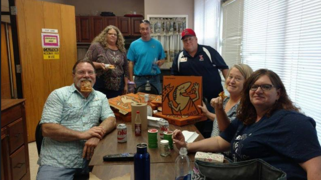
Pictured: Monroe Clinic staff

Our Monroe Behavioral Health Clinic won an office wide pizza party as part of the NE Delta HSA Penny Wars competition that pitted each of our seven clinics and regional office against each other for a wonderful cause. All proceeds raised were donated in support of breast cancer awareness.