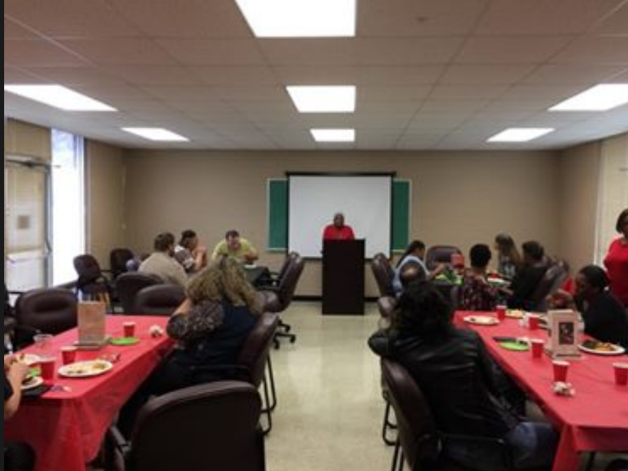
A photo of our Monroe clinic staff enjoying a soul food luncheon and ceremony presentation.