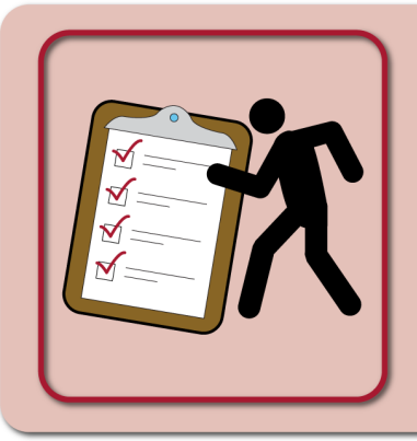
Figure 2: Screening Requirements to Determine Eligibility for Peer Support Specialist Certification in Six Selected States, as of May 2018

To determine applicants' eligibility for peer support specialist certification, all six state programs we reviewed have screening requirements applicants must meet when applying for certification. These screening requirements include requirements related to education, lived experience with mental illness, prior work or volunteer experience, and letters of recommendation. The extent to which each screening requirement was used by each state varied, and the specifics of each requirement also varied across the six programs we reviewed (see fig. 2).