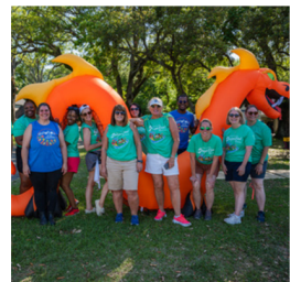
2024 Dragon Boat Festival