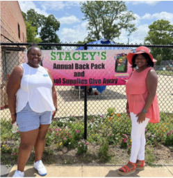
Super Saturday Annual Backpack Giveaway