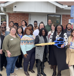
West Monroe Early Head Start center reopens