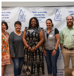
2024 Annual Meeting