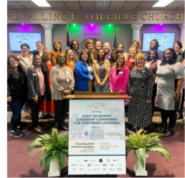
2024 Louisiana Early Ed Day