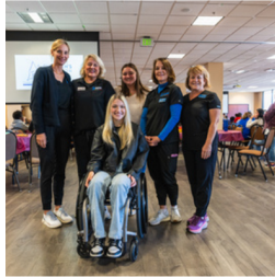
2023 Annual Youth Leadership Summit