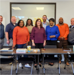
4th Judicial District Youth Services Planning Board