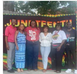
Juneteenth in the Origin Bank Family Garden