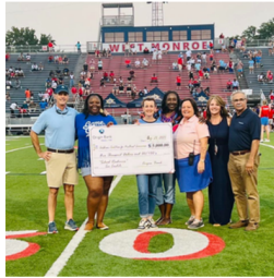
Origin Bank School Readiness Tax Credit Check Presentation