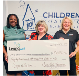
Living Well Foundation awards $83,830 grant to Signs of Suicide