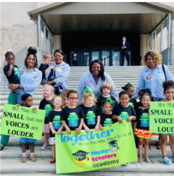
2024 Early Ed Day at the Capitol in Baton Rouge