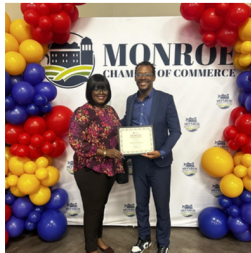
2024 Thomas H. Scott Award Nominee