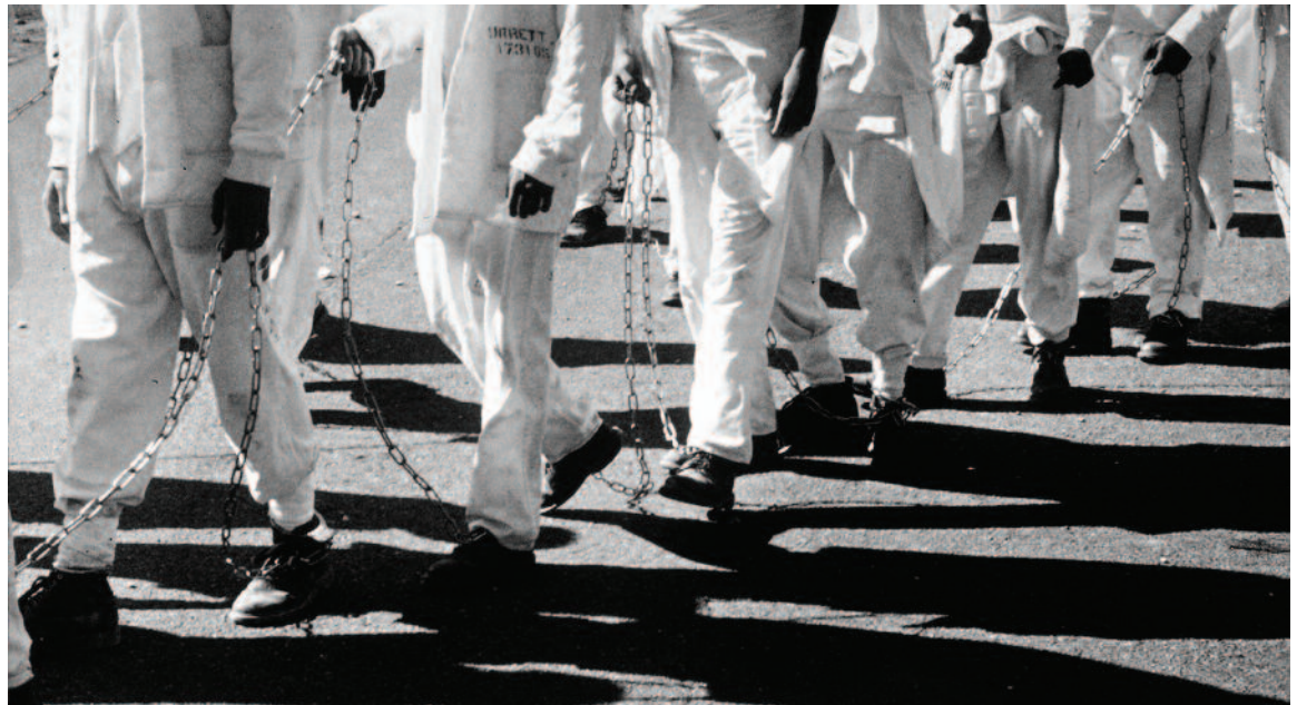
Prisoners from Limestone Correctional Facility in Alabama work on a "chain gang" as punishment, 1995.

Lynching also racialized criminality. Whites defended lynching as necessary to protect their property, families, and Southern way of life from dangerous black criminals, both in response to allegations of criminal behavior and as a preemptive strike against the threat of black violent crime. Although the Constitution's presumption of innocence is a bedrock principle of American criminal justice, African Americans were assigned a presumption of guilt.