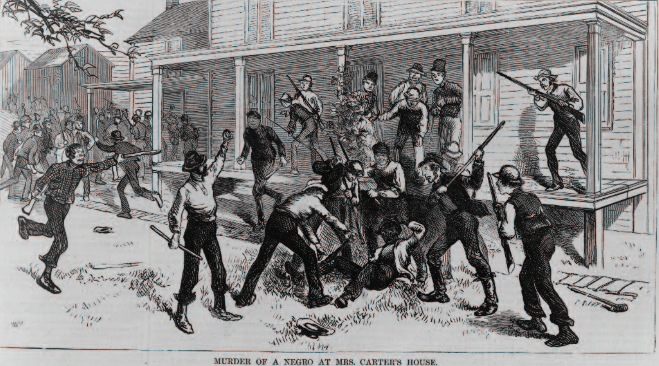
MORNAR OF A MEGRO AT MAS, CARTERS HOUSE.