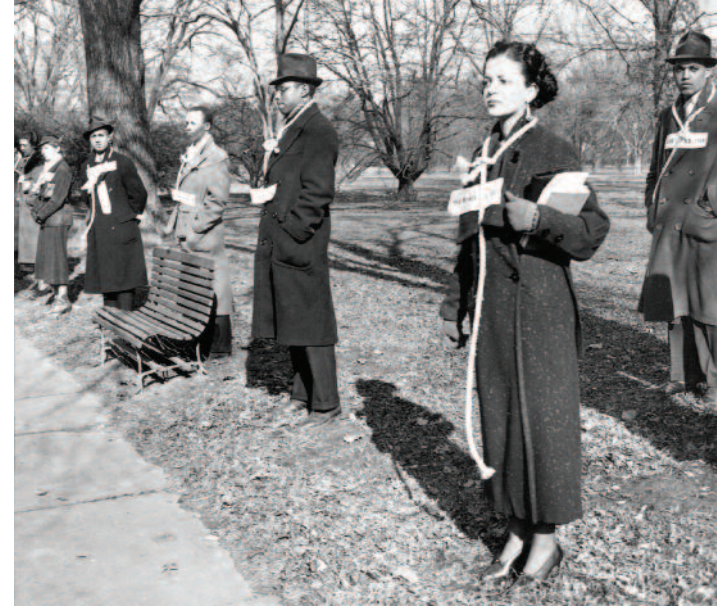
Howard University students protest lynching, 1934.

Black efforts to combat racial violence during the lynching era gave rise to many important black organizations, including the nation's most effective and longstanding, the National Association for the Advancement of Colored People (NAACP). The NAACP formed in direct response to racial attacks in Springfield, Illinois, in 1908 that shocked Northerners and demonstrated that lynching was not only a Southern phenomenon. The NAACP's campaign decrying lynching as