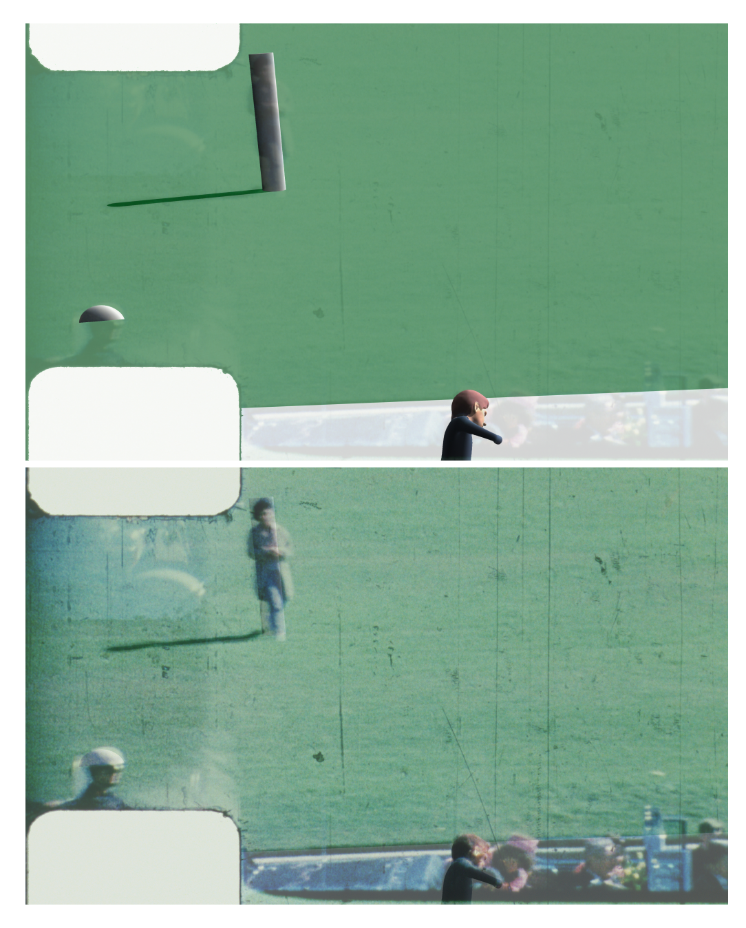
Figure 6: The rendered 3-D scene superimposed on top of the original frame 317 (Figure 1) with 80% and 20% opacity. See also Figure 7.