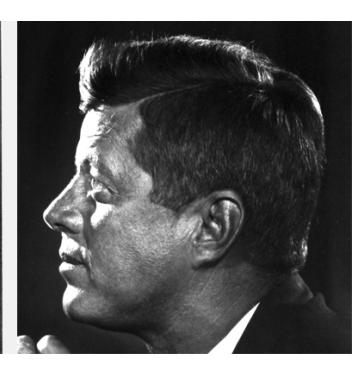
Figure 2: Profile and frontal views of JFK. See also Figure 3.