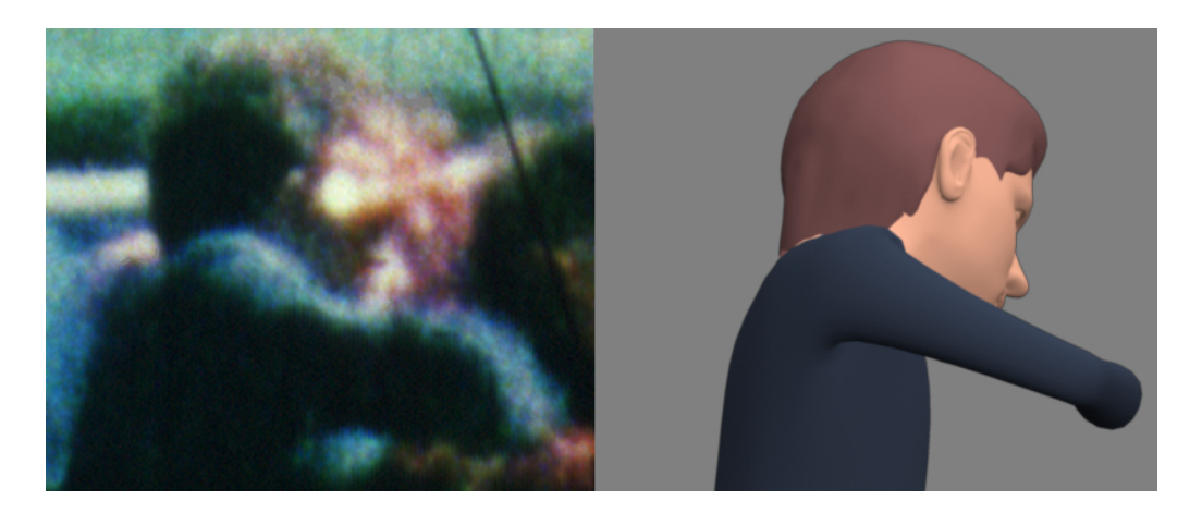
Figure 4: Shown on the left is JFK in frame 317 and shown on the right is our 3-D model (illuminated with only ambient lighting).

This 3-D head model was combined with a generic<sup>1</sup> articulated 3-D body<sup>2</sup>, and rendered in the 3-D modeling software Maya ( Autodesk ). Shown in Figure 4 is a rendering of the combined 3-D head and body, positioned to be consistent with JFK's body/head pose in frame 317.