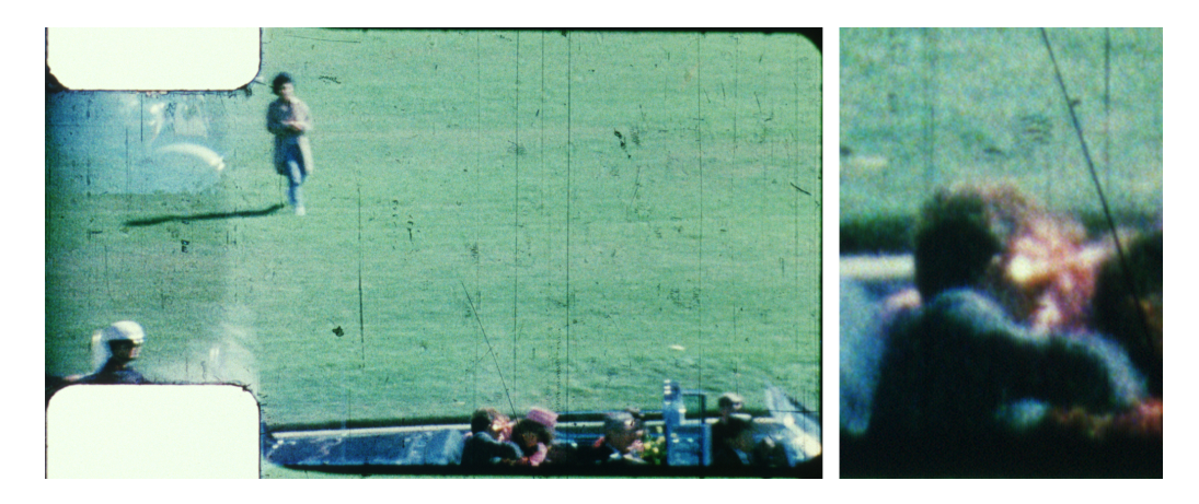
Figure 1: Frame 317 of the Zapruder film (left), and a magnified view of JFK – the authenticity of the shadow on the back of JFK's head has been called into question.

its public release in 1975, challenges to the authenticity of the Zapruder film began to surface (e.g., [2, 3, 4, 5, 6]). The Zapruder film has been analyzed for evidence to support alternate theories of who and how many people were involved in the assassination. For example, it has been argued that on frame 317 (and neighboring frames) what appears to be a shadow on the back of JFK's head, Figure 1, is the result of tampering, purportedly to conceal evidence of a shot exiting through the rear of JFK's head. This shot could only have come from a second shooter, as Oswald was positioned behind JFK.