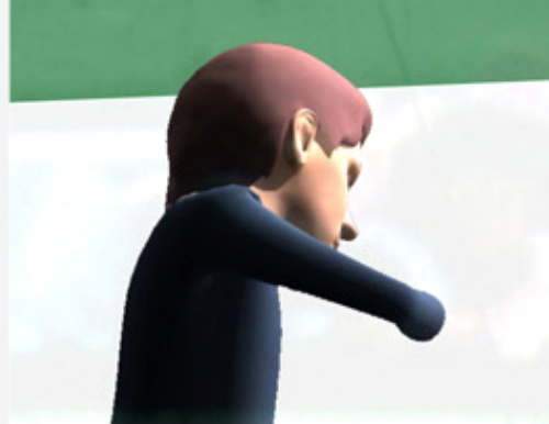
Figure 7: The original and 3-D rendering of JFK on frame 317. Note the consistency in the shadows on his head and body. See also Figure 6.

the lighting gradients on his shoulder and arm are consistent with the original photo. The slight differences in the precise shape of the shadow on the back of the head are due to differences in the underlying 3-D shape of the hair, which are difficult to precisely model.