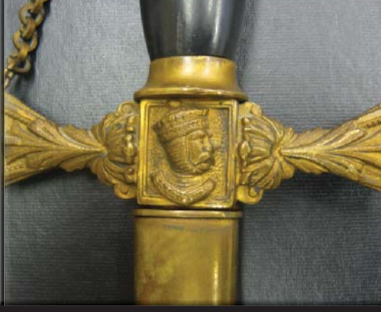
Knight's head on sword's pommel