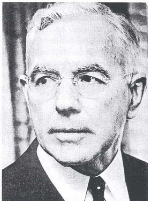
John McCone, Director of Central Intelligence during the Cuban Missile Crisis

offensive missile installations. Others in the defense and intelligence communities dissented from this opinion.