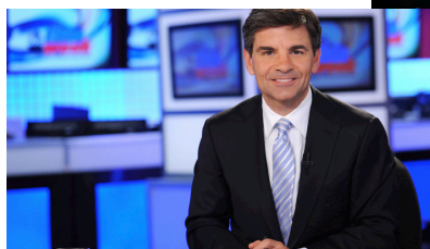
This Week with George Stephanopoulos