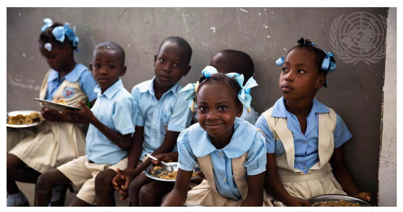
Students at the St. Esprit National Education Centre in Grand Chemin, Haiti, during the visit of the ECOSOC Ad Hoc Advisory Group (AHAG). The ECOSOC-AHAG visited Haiti from 22–24 May to assess the country's socioeconomic situation, discuss development priorities with national authorities, and reinforce the partnership towards sustainable development. 23 May 2019.