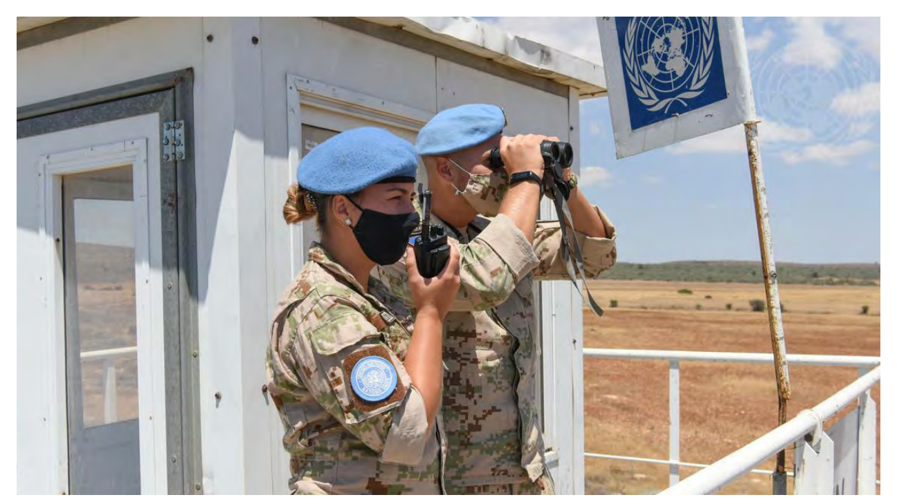
Peacekeepers serving with the United Nations Peacekeeping Force in Cyprus (UNFICYP) monitor the buffer zone situation. 17 June 2021.

A memorandum of understanding is a similar agreement between the UN and a TCC. It addresses the TCC's responsibilities to the United Nations, such as the size, type, and duration of the contingents to be used, equipment, liability, claim and compensation, administrative and budgetary matters, and so on.