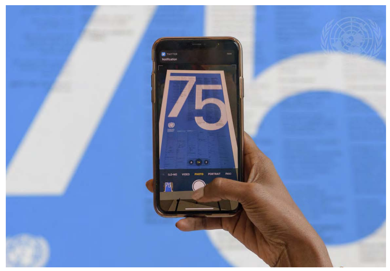
To commemorate the 75th anniversary of the United Nations, Volkan Bozkır, President of the seventy-fifth session of the United Nations General Assembly, invited all Member and Observer States to sign the Preamble of the UN Charter as a symbolic gesture of recommitment to its principles. 22 October 2016.