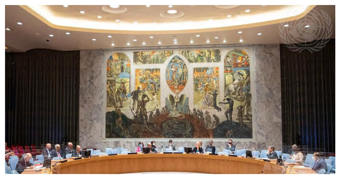
A wide view of the meeting with Secretary-General António Guterres and the Foreign Ministers of the five permanent members of the Security Council. 22 September 2021.

These agreements contain provisions on privileges and immunities for the UN entity and its personnel that typically reflect the General Convention and can include additional privileges, immunities, and facilities beyond the General Convention. Such agreements also set out provisions intended to facilitate UN operational activities and assistance to be provided by the government in this context.