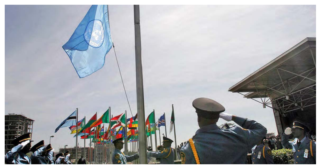
Flag-raising ceremony at UNECA Headquarters in Addis Ababa, Ethiopia. 24 October 2006.

One group of specialized agencies comprises the International Labour Organization (ILO), the Food and Agriculture Organization (FAO), the UN Educational, Scientific and Cultural Organization (UNESCO), the UN Industrial Development Organization (UNIDO), and the World Health Organization (WHO). These organizations have all been brought into relationship with the United Nations and are formally recognized under the Charter. Their budgets are raised by assessment from their Member States but not as part of the United Nations regular budget.