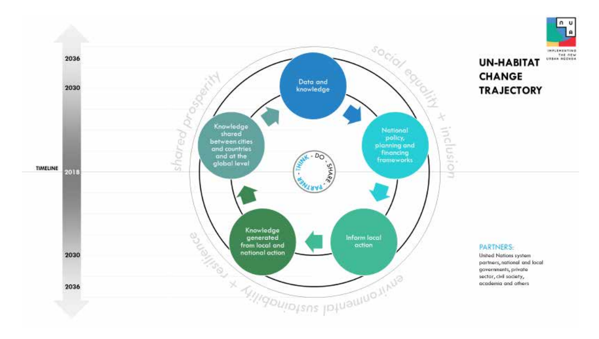
Figure 2 Think and partner

191. Achieving sustainable urban development is seen as a continuum that involves generating knowledge and supporting local implementation, monitoring results and then advancing to the next stage. It will be of key importance that the development of drivers of change and catalytic local actions are both effectively monitored, communicated and disseminated as best practice. That will enable stakeholders to continue to be engaged in the process and ensure that outcomes are on course with common objectives, while enabling lessons learned to be transferred to contexts in which they can be replicated and scaled up. UN-Habitat, present on the ground and with strategic partnerships, is uniquely placed to effectively utilize its niche knowledge position and convening capacity to leverage the efforts of others to accelerate the achievement of urban goals.