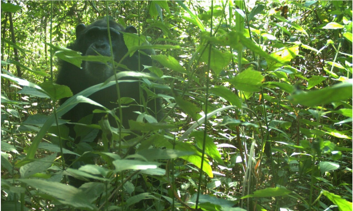
A curious chimpanzee.

Hundreds of thousands of images later, stunning pictures have emerged that shed light on the vast array of wildlife that inhabit these remote forests.