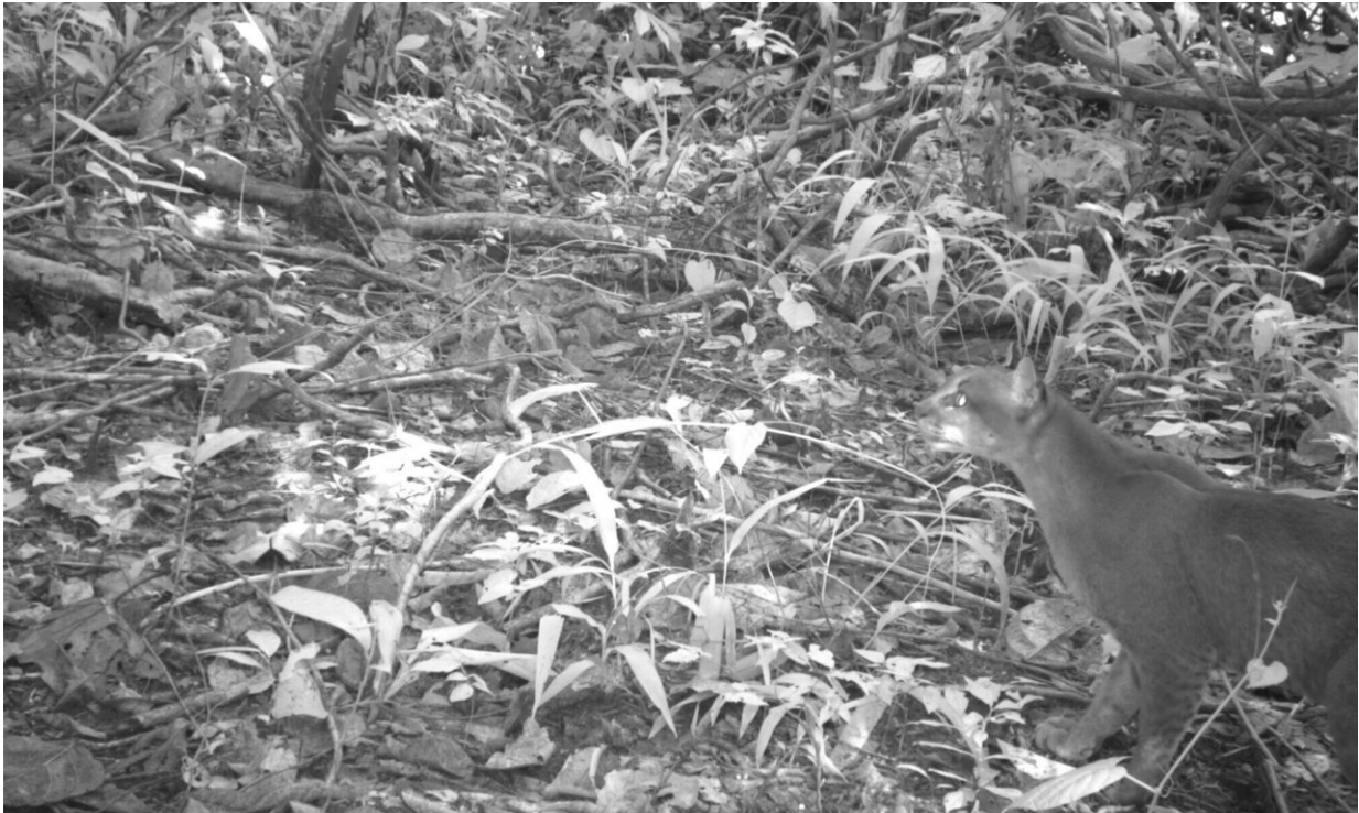
An African golden cat.

online citizen science; a collaborative project of the University of Oxford, Chicago's Adler Planetarium, and the broader Citizen Science Alliance.