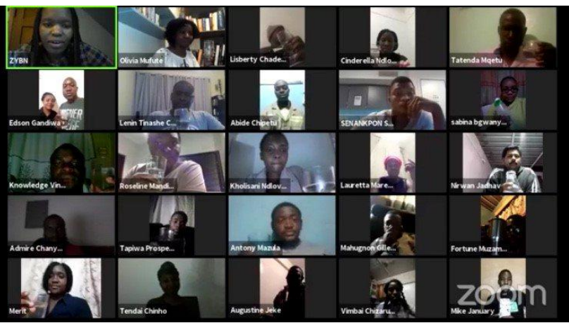
Image 5: A snapshot of youth conservationists during a virtual workshop in Zimbabwe

AWF is also partnering with the Global Youth Biodiversity Network (GYBN) to promote African youth participation in national consultation meetings in preparation for the 2020 UN Biodiversity Conference in Kunming, China, in May 2021. This is the fifteenth meeting of the Conference of Parties (COP 15) to the Convention on Biological Diversity (CBD) designed to review the CBD's Strategic Plan for Biodiversity