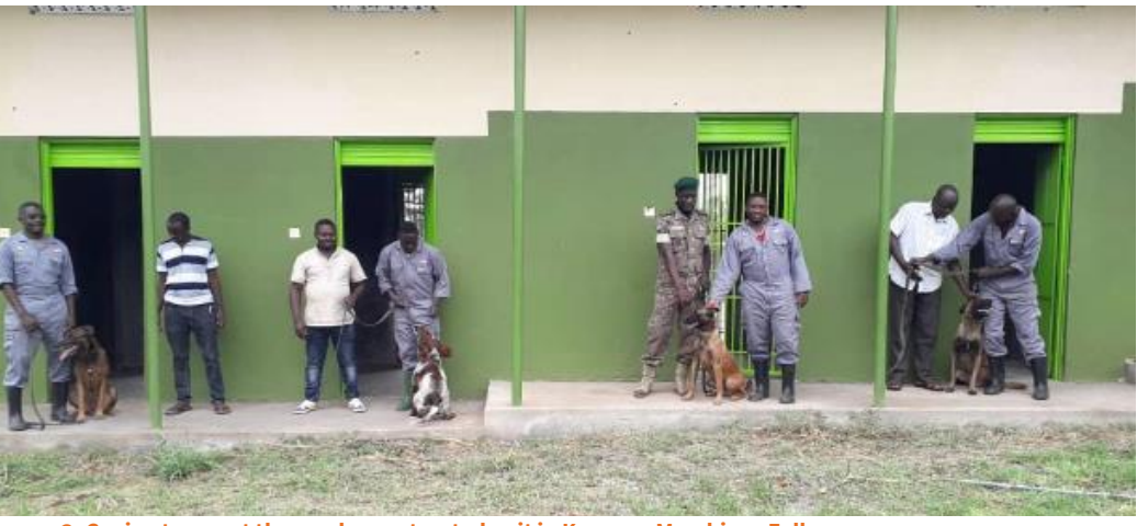
Image 3: Canine teams at the newly constructed unit in Karuma, Murchison Falls

Since the inception of C4CP, AWF has trained and deployed over 70 dog handlers and 48 dogs to transit points in Kenya, Tanzania, Uganda, Mozambique, and Botswana, with expansion plans to Cameroon and Ethiopia. Currently, in total AWF supports nine detection dog units in five African countries and four-tracker dog units in three African countries and is determined to expand the capacity of wildlife authorities across the continent to detect and stop illegal wildlife trafficking. Teams have searched over nearly 2 million cargo containers and nearly 850,000 pieces of luggage.