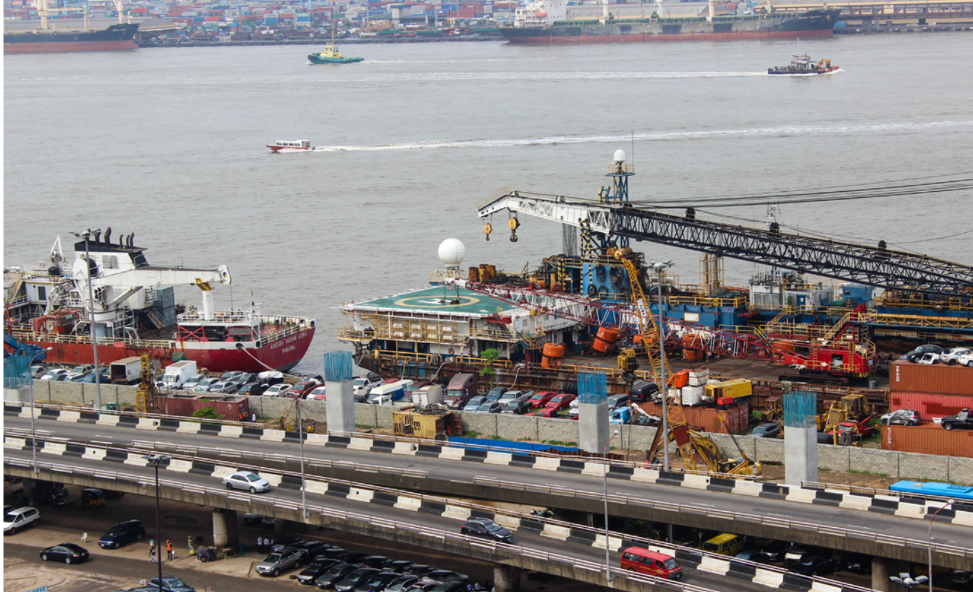
Above: Apapa Port in Lagos - a common exit point for illegal shipments of pangolin scales and ivory leaving Nigeria