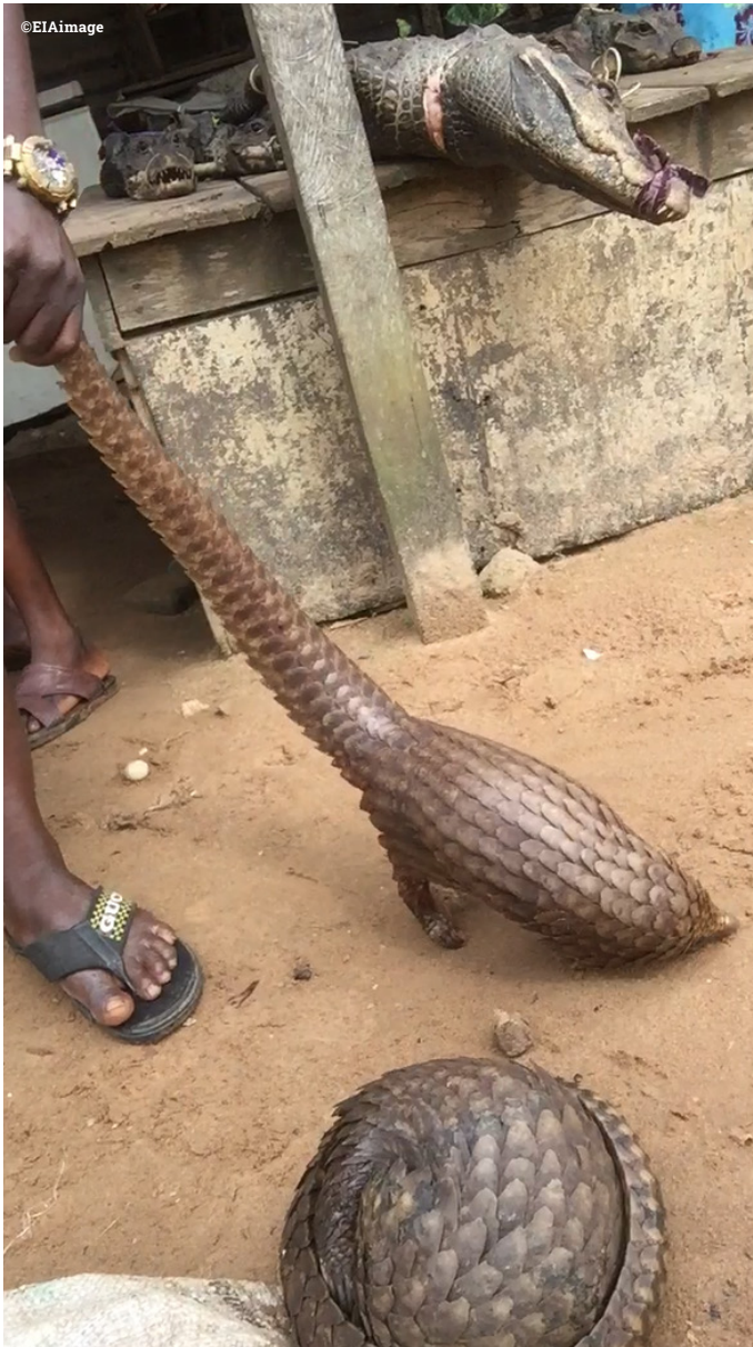
Below: Live pangolins for sale at a Lagos market

8. Finally, the National Parks Services Act is concerned only with offences that occur within national parks. Wild animals found outside of national parks are not deemed to be the property of the Federal Government of Nigeria and even when found near a national park, there must be some evidence it was found in a normal migratory route or pattern to or from the national park. Accordingly, when it comes to investigation and detection of offences, the NPS is very much limited to offences within those boundaries. Offences falling outside a national park will have to be considered in the context of the relevant state or federal law.