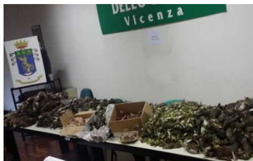
Figure 19. Dead specimens found during the action day of Operation Free Wildlife.

Document fraud is an integral part of the birds' trade across countries. Transporters use forged CITES documents, or declare the trade of different species, or that the specimens are bred in captivity and not caught in the wild. Shipping companies falsify consignee statements and couriers use fraudulent identity documents while travelling. Increasingly, criminal sellers attach counterfeit rings to birds' legs captured in the wild, to pretend that they come from legal breeders. Transporters also make large use of corruptive methods and bribes to pass border controls. At arrival, birds are caged in warehouses while waiting to be sold. In many instances, illegally traded birds are sold online, in pet shops as well as at national and international fairs, which confirms once again the systematic links between legal business structures and illegal bird trafficking. Some networks also sell dead specimens as food in restaurants or to food processing factories.