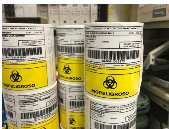
Figure 4. Toxic sanitary waste illegally stored and seized as part of Operation Retrovirus.