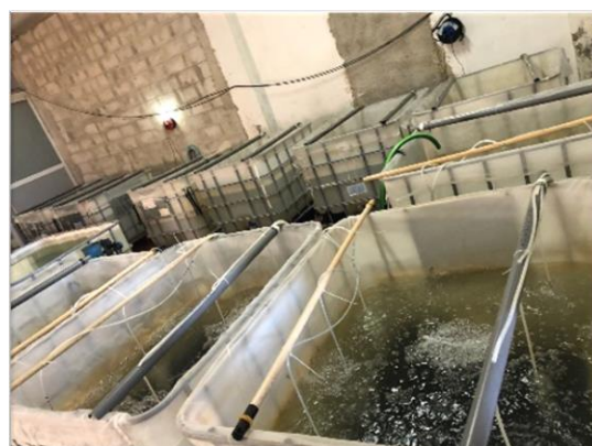
Figure 7. The EU aquaculture facility used before shipping the glass eels to Asia, discovered as part of Operation Lake II (ELVERS).