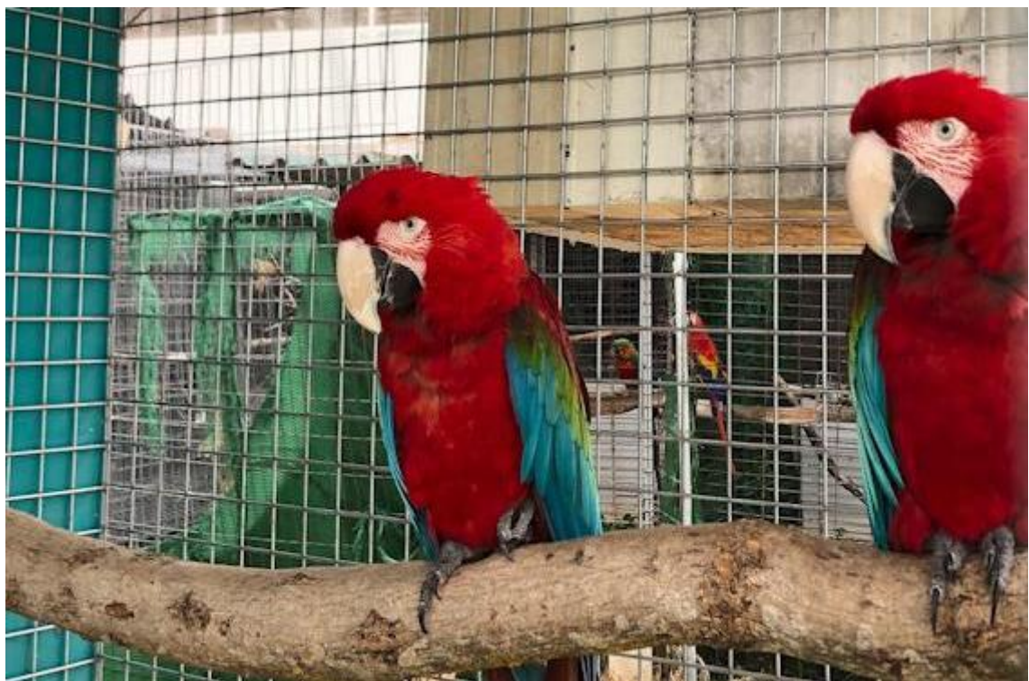
Figure 17. Parrots seized during the action day of Operation Citred.

Trafficking in birds and bird eggs is a very lucrative crime, requiring veterinary expertise and the use of sophisticated equipment. Some species can reach several hundreds of thousands of euros on the black market. The demand driving this illicit trade comes from collectors and breeders, but also from those who want birds as pets. Poachers in Central America for example, sell toucans for EUR 50 euro each to traffickers operating in Europe, who then sell them to final customers for up to EUR 7 000 per bird. Parrots are also targeted by EU criminal traders, with many species threatened by extinction partly due to illicit pet trade 37 . However, there is still limited legal protection in place as only two parrot species are protected under CITES.