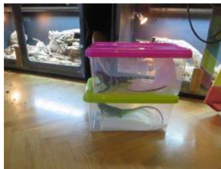
Figure 14. Live specimens sold illegally at a reptiles show, discovered in the context of Operation Jungle V.

The transport of reptiles is carried out by mules (many with European citizenship), who conceal the specimens inside suitcases or taped to their bodies, travelling by air on commercial flights (in some cases, live animals are even transported refrigerated). Criminal traders in the EU, occasionally operating in a crime-as-a-service mode, are responsible for the collection at arrival and further distribution to European and Asian markets, via trading and transport companies. Reptiles are also hidden among other goods. Export and import documents are usually forged or totally fabricated. Often, the specimens are labelled as non-CITES, the same documents for legal import of stock are used for illegal purposes and for the final sale (the so-called laundering of species). Traders, couriers and mules often also make use of fraudulent travel and identity documents and regularly bribe CITES and other controlling authorities. In the EU, criminal traders sell reptiles at animal fairs and shows, in regular pet shops and online. Retailers operate on dedicated online marketplaces as well as on social media and other websites. Reptiles are also traded on the dark web. Sometimes, buyers attempt the illegal breeding of trafficked species, with associated risks for the ecosystem, through the introduction of alien species.