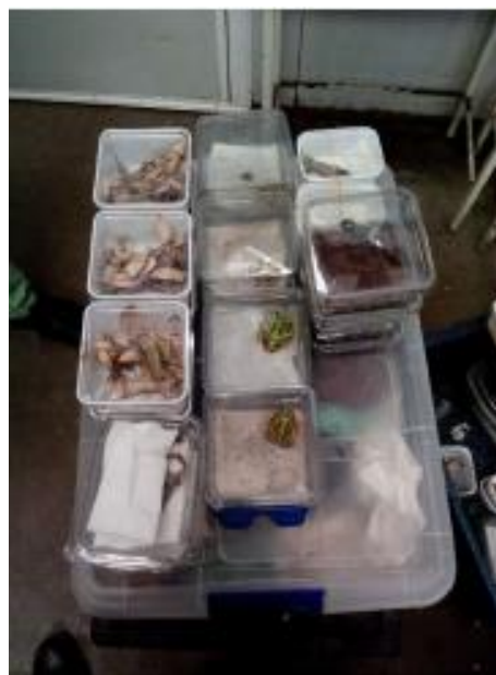
Figure 15. Live reptiles seized during the action day of Operation Jungle V.