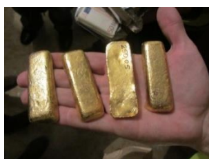
Figure 9. Gold seized during the action day of Operation Lake II.