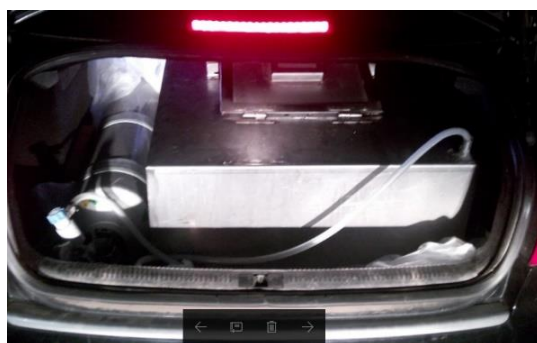
Figure 6. Vehicle trunk used for the transport of 15 kg of glass eels, discovered as part of Operation Lake II (ABAIA).

Chinese and European criminal networks cooperate at different stages of this illegal activity. In the majority of cases, European criminals organise poaching in the riverbanks of several Western European MS and the preparation of the transfer outside Europe, which is then taken over by the Chinese partners through trading companies. In some cases, poachers collect specimens from multiple countries and transfer significant amounts of glass eels (sometimes several tons) to aquaculture facilities in other MS, before dispatching them to Asia to conceal their real origins. Criminal networks use more often facilities in the Balkan region, eastern Europe, North Africa, and western Asia, as transit points for large quantities of eels before their transfer to Asia. In just one season, a European network could orchestrate the poaching and transfer to Asia of up to 5 tonnes of living glass eels, for a total profit of EUR 10 million. In China, the profit of the Chinese networks has been estimated at around EUR 50 million per year of activity. In another case, a criminal network was engaging with multiple Asian clients at the same time, in order to maximise profits during the high season of eel births.