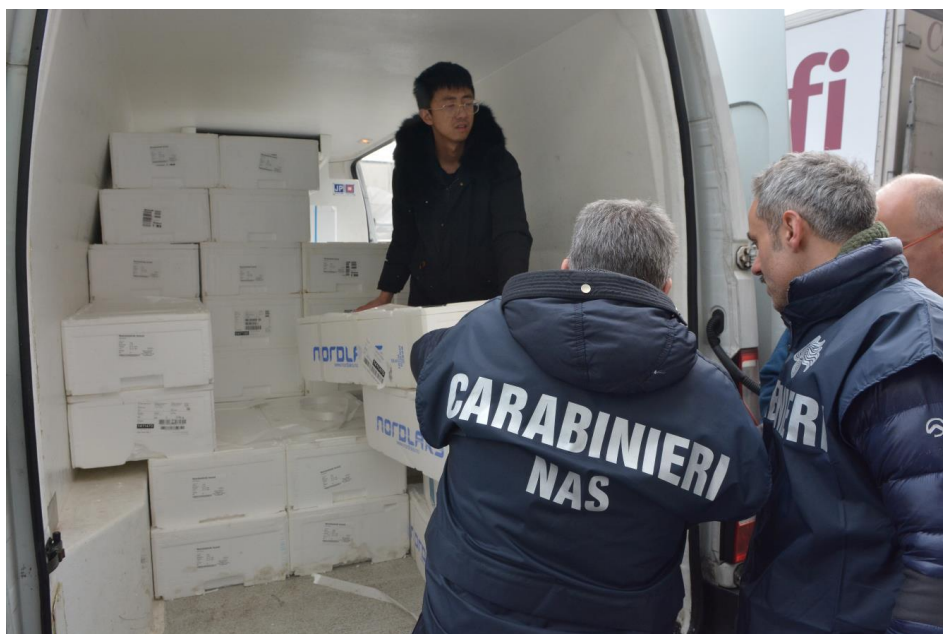
Figure 25. The seized van in which the Chinese crabs were transported.