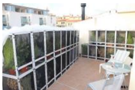
Figure 16. An illegal captivity breeding location discovered in the context of Operation Jungle V.