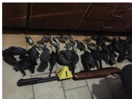
Figure 18. Dead specimens found during the action day of Operation Fennec.