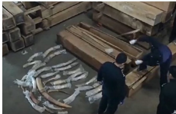
Image 1: The repeated concealment method used by the Chen OCG involved custom-built wooden crates to conceal the ivory, which were hidden in shipping containers behind layers of stacked timber planks.

The first seizure connected to the network was made in July 2013 at Shatian port in Guangdong province, China. Customs officers detected 4.46 tonnes of ivory and 7.57 kg of rhino horn concealed in two shipping containers, which were packed in wooden crates and hidden behind layers of timber planks. The three Chens were identified as the owners, but they managed to escape from China overland to Malaysia before authorities were able to arrest them.