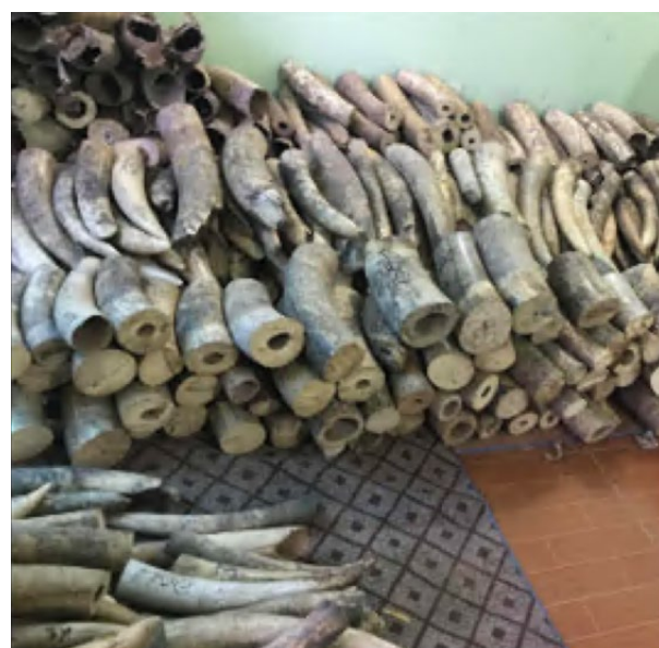
Image 3: Photo of a large stockpile of ivory in Vietnam sent by traders to WJC investigators in June 2019.

Vietnam's COVID-19 response has further compounded this situation. The government has introduced a range of border security measures such as barring the entry of foreign nationals, not issuing visas until further notice, and suspending passenger flights to and from mainland China 13 . Several Vietnamese persons of interest have stated that they cannot transport wildlife into China due to 'closed roads' and the suspension of bilateral trade between Vietnam and China. This is affecting traffickers' business operations as legitimate products that are often used to conceal illicit wildlife products are also blocked from crossing the border. In their desperation to offload stock, some traffickers have been willing to offer discounts.