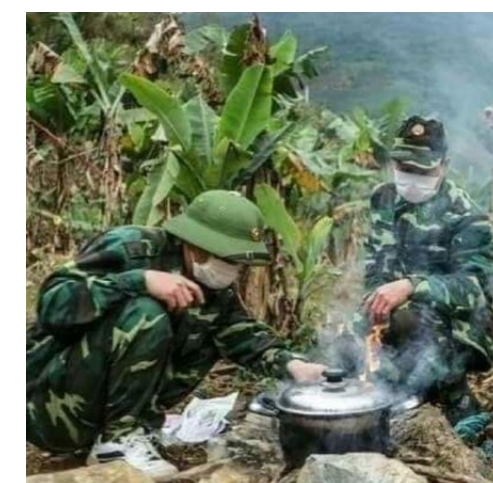
Image 2: Military officers maintaining a presence along the border.