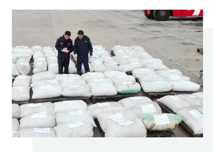
Image 3 - 10 December 2016, 3.1 tons of pangolin scales discovered in timber shipment in Shanghai, China<sup>15</sup>.

It is unclear from where pharmaceutical producers source the "legal" pangolin scales for their products. The international ban on importing pangolin scales which has existed since 2017, coupled with the high demand within China<sup>14</sup> and the lack of captive breeding facilities for pangolins, suggests that producers are using illegally imported wild pangolin scales as their main supply.