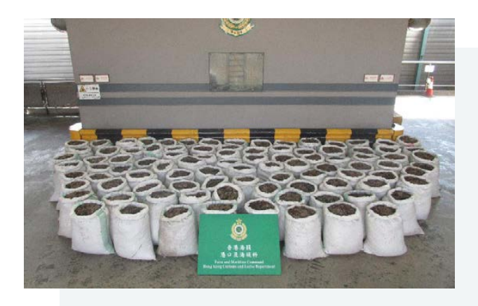
Image 1 - 20 July 2018, 7.1 tonnes of pangolin scales seized from a container at Tsing Yi Cargo Examination Compound, Hong Kong SAR originating from Nigeria<sup>4</sup>.

It is suggested that the bodies of the poached pangolins may be fueling the bushmeat market in