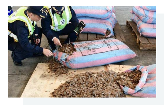
Image 2 - 1 July 2017, 11.9 tonnes of pangolin scales discovered in a container at Yantian port, China<sup>7</sup>.

Trafficking by sea remains the preferred method for moving large quantities of pangolin scales, accounting for 53.8% (n= 28 of 52) of the seizures throughout the reviewed period. Seizures of pangolin scales at international seaports are increasing, but it is also likely that a significant proportion of smuggling by sea still passes undetected<sup>6</sup>.