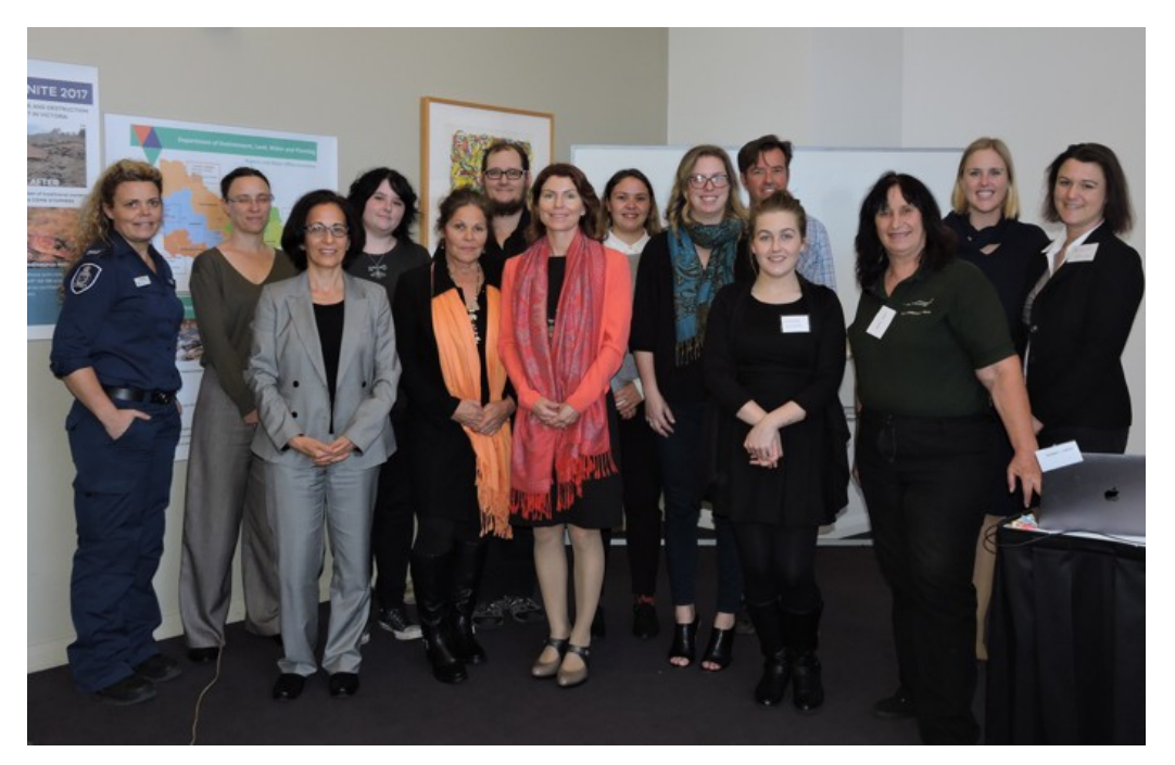
Delegates at the Wildlife Trafficking Workshop