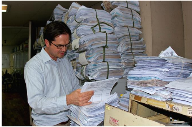
New England Aquarium