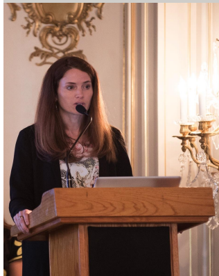
New York University