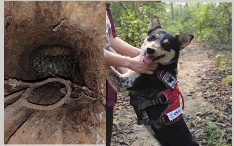
University of Washington