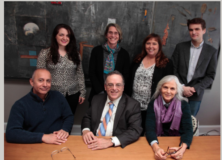
National Whistleblowers Center