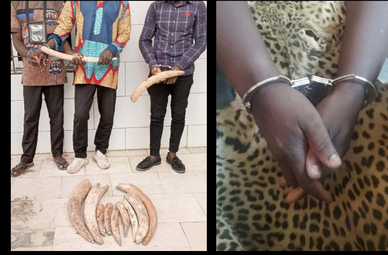
3 traffickers arrested with 11 elephant tusks in Côte d'Ivoire.