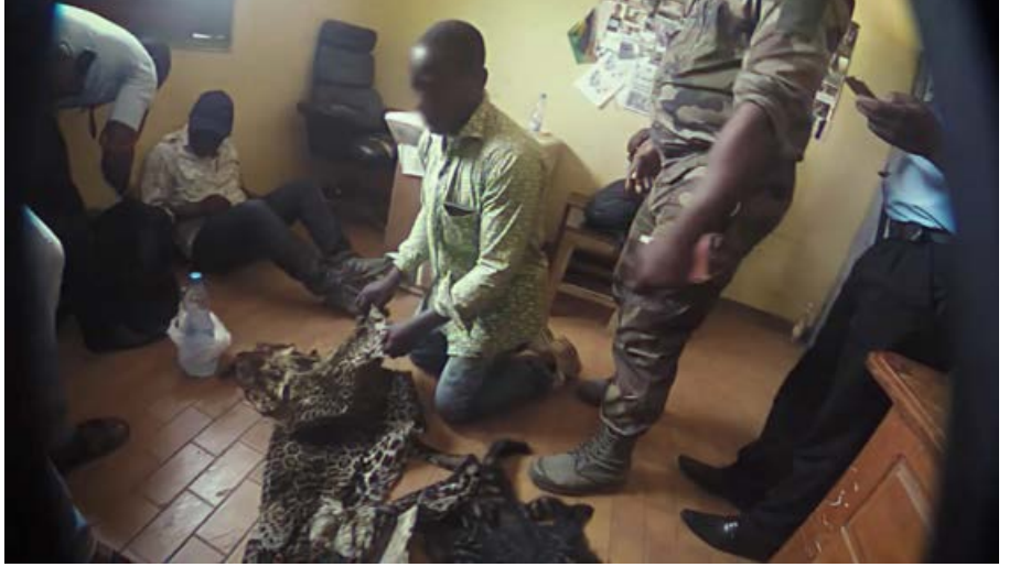
Ivory trafficking and Poaching, a hard-hitting documentary on ConservationJustice's work to combat ivory trafficking was released.

The Activities Coordinator held meetings with the Director of US Agency for Global Media and discussed preparations for the workshop with journalists.