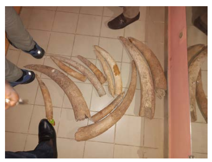
3 traffickers arrested with 11 elephant tusks in Côte d'Ivoire.

3 traffickers arrested with 11 elephant tusks in Côte d'Ivoire. 2 of them trafficked the ivory from the west of the country and collaborated with the third trafficker in Abidjan who stocked the ivory and harbored them.