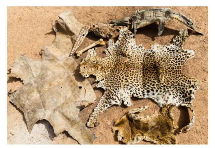
A trafficker arrested with a leopard skin and other contraband in Senegal.

Ivory trafficking and Poaching , a hard-hitting documentary on Conservation Justice's work to combat