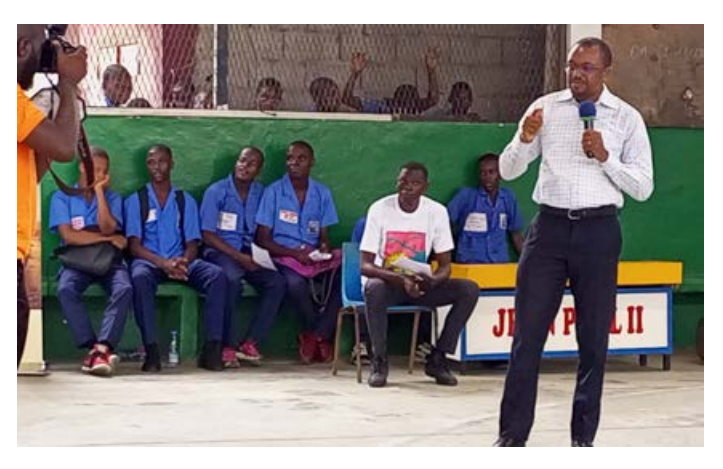
The Head of Legal Department at the event to raise the awareness on the plight of the pangolin.