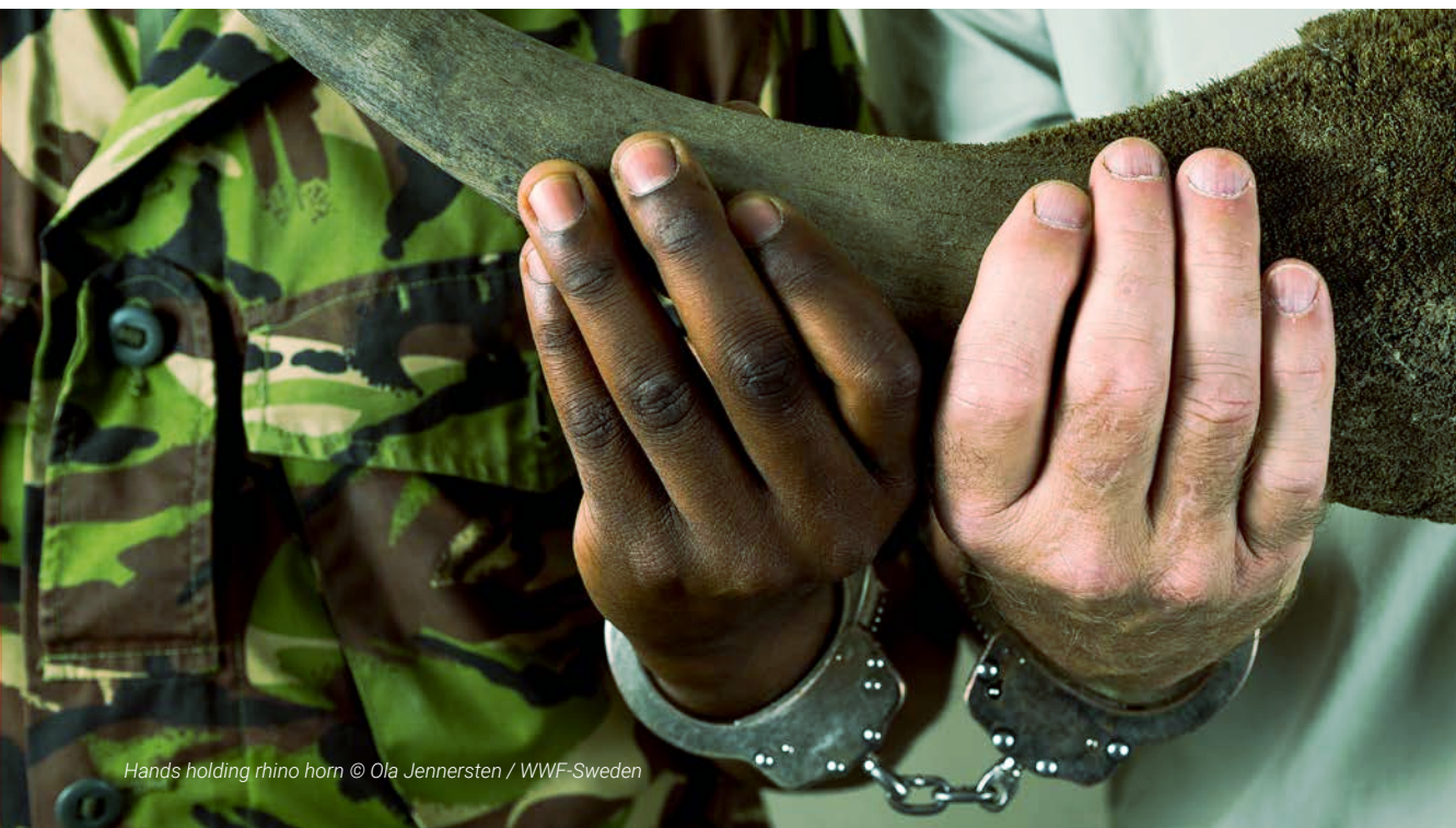
Hands holding rhino horn